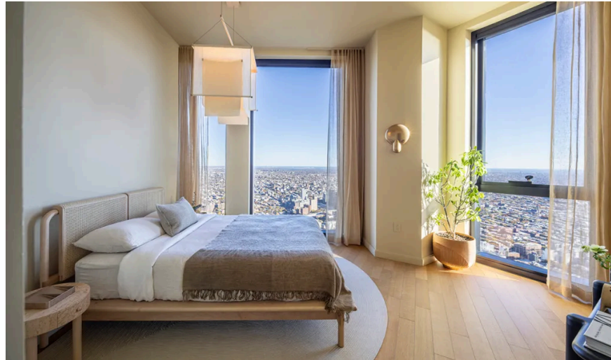
Tall window in the primary bedroom frame the local cityscape, and beyond. Sean Hemmerle

Brooklyn Tower is home to 100,000 square feet of exclusive indoor and outdoor amenities as well. The Life Time Athletic Club is where most of them are found, including a 75-foot indoor lap pool, billiards room, library lounge, theater with a wet bar, kids playroom, outdoor pools, and a fully serviced poolside lounge and atrium. Residents have access to other dedicated features, too, like a children's playground, off-site parking, and Sky Park, which has a basketball court, a foosball table, and a dog run.