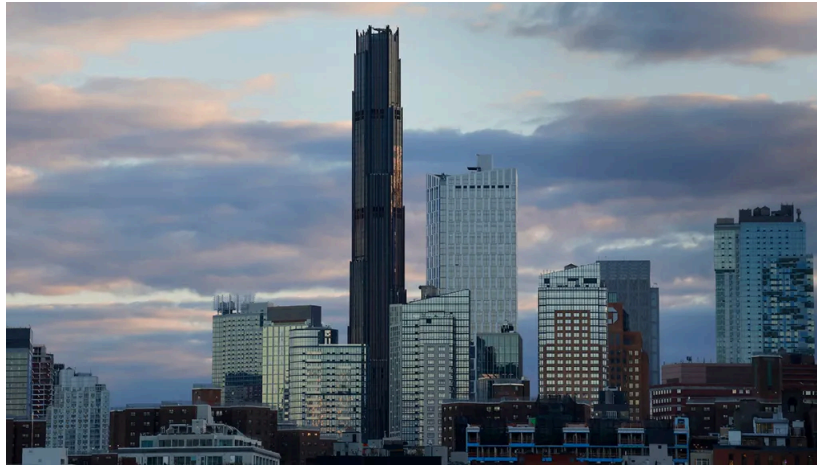
Brooklyn Tower (center left) was designed by SHoP Architects.

Owners and their guests arrive at a private elevator lobby with a foyer and an extensive gallery at either end of the hall. Beyond the foyer, the great room has heart-skipping panoramic vistas of Kings County, the Manhattan skyline, and beyond. Floor-to-ceiling windows capped by 12-foot ceilings and European white oak floors in a custom honey stain accentuate those horizons, alongside mahogany millwork and bronze detailing.